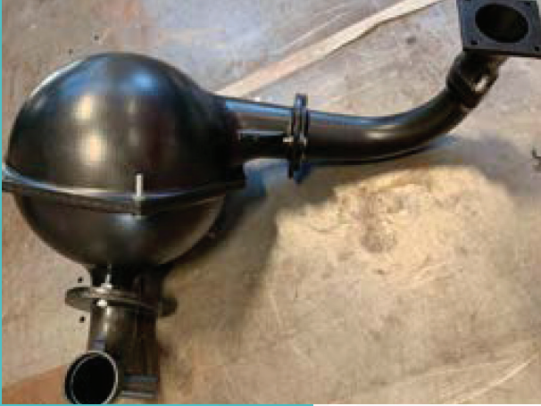
The completed plenum assembly.