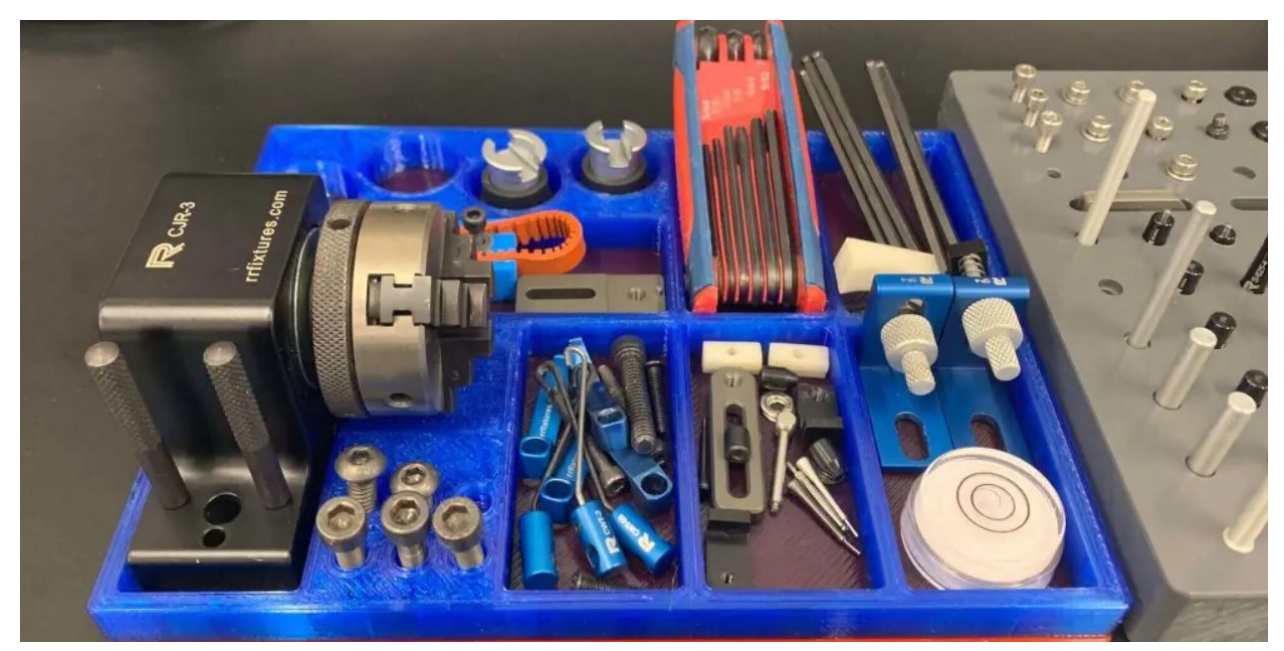
Custom 3D printed tool storage, demonstrating the lean manufacturing 'poka yoke' principle

After deciding on Ultimaker, the next question was what printer? For a larger build plate, to maximize air quality in the office area, and to easily swap materials, the decision was clear: Metro Plastics went with the Ultimaker S5 Pro Bundle.